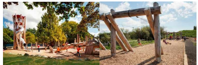
Figure 5. Terra Nova children's playground, Richmond, Canada.

high-altitude games and games that may get lost [48]. Research shows that risk-taking activities are positively correlated with physical skills, mental health, independent judgment and risk management ability, which provide children with health and development benefits that other activities cannot achieve [62]. And there's little evidence that dangerous games increase the risk of injury [63], and by letting kids try, they have a stronger sense of their own safety. The natural playground is the first choice for children to carry out adventure games. The natural open environment and non-standard natural facilities bring unrestricted play environment for children to explore and shape freely [64]. At the same time, strong branches of trees, steep rocks, streams, scattered logs, swinging ropes, mud pits, bricks and other natural adventure elements can be used for children to climb, hang, jump up and down, balance walk, leap and other challenging activities. (e. g., Figure 5)