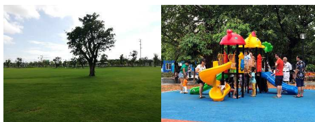
Figure 2. Artificial nature and model play facilities in urban parks.

The over protection of children cannot create more opportunities for adventure. Taking risks is the basis for kids to explore and understand the world [45]. Children need to participate in activities with certain risks in the process of growing up. However, the construction concept of absolutely safe playground limits designers to providing specific facilities for safe play, thus losing the potential of exploring playground for children's adventure activities. (Figure 2)