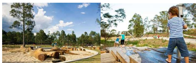
Figure 3. Nature playground in Lizard Log Park, Sydney, Australia.

wooden piles for children to carry out richer games; (2) The other is to retain the "moving/loose parts" brought by nature [55], such as fallen branches and leaves, sand and gravel, etc. if possible, certain auxiliary materials and tools can be provided to help children carry out the creative activities of "construction-eradication-reconstruction" that excite them [13]. (e. g., Figure 3)