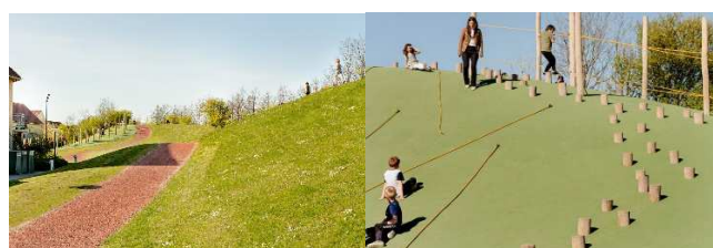
Figure 4. Activity site of Kastrup community park, Copenhagen, Denmark.

Children generally like to play in the space with rich levels of change. The undulating terrain is the key factor to determine the interest of the playground, not just as an ornamental background in the park. The theory of "prospect-refuge" states that children need not only "a place with broad vision" to get the sense of "monitoring" and "planning", but also "a place to provide shelter" to obtain a solid sense of security [56]. If the two factors are brought together to provide a place for "observing the prospect without being found", then it can effectively enhance the stimulation and interaction of children's play. The concave-convex terrain and holes can fit the psychological needs of children, and naturally create an excellent place for play [11]. In addition, the changing terrain and simple auxiliary climbing facilities can stimulate more physical activities. Rushing or climbing the hillside and then sliding or running down is a kind of exciting exercise for children. (e.g., Figure 4)