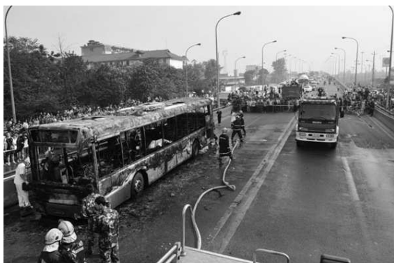
Figure 3. A bus fire disaster, Chengdu, China, 2009.

A public bus design for example, should require an intensive thinking about systematic functions, in which an efficient way for passenger security (such as suitable emergency switch or hammer) will be the first important factor among them. But, if without full training and education the social responsible awareness for designer, a fatal harm caused by inapplicable design of emergency switch or hammer would be the most probable result in the unexpected dangerous situation. (Fig.3)