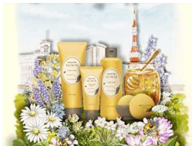
Figure 1. The IGNIS H series.

supply depending on function and convenience. In other words, they are typical examples of affective products [1, 2]. Therefore, besides incorporating the kansei values essential for top-selling products (e.g., a reliable effect on the skin, an enjoyable feeling that makes customers want to keep using it every day, and an “addictive” fragrance that leads to continued usage) to the product itself, factors such as the packaging design, advertising and publicity, and environment where they are sold are important. It really is essential to keep providing value consistently, from the time customers consider purchasing to when they actually purchase the product, use it, and finally, dispose of it. Therefore, it is more appropriate to think that customers are actually paying for an experience (from encountering and learning about the product to finishing with it and making a repeat purchase) rather than paying merely for its function and convenience. Figure 1 shows the IGNIS H series products.