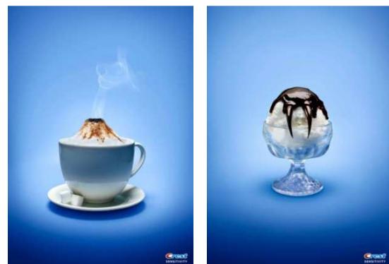
Figure 4. Symbolic product advertisement with negative metaphor.