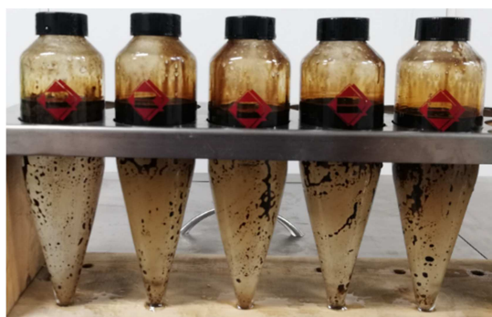
(from left to right: Tea/FP/APAE/SP)