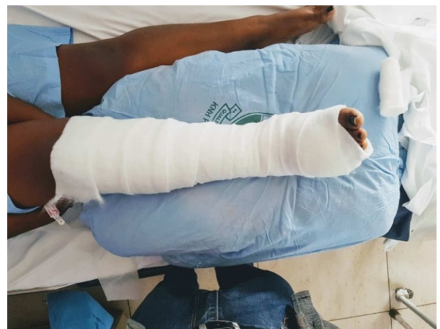
Figure 1. Soft pad applied on the limb with cellulitis.

All patients had elevated white blood cells count at the time of admission. There was no statistical difference in both groups for the number of patients whose white blood cell counts returned to normal levels both on day 2 and 4. The length of hospital stay in group A patients was 10.6 days while in group B patients 13.2 days. This was statistically significant. 5 patients in group A had superficial ulcerations compared to 4 patients in group B. (This was not statistically significant) 3 patients in group A and 4 Group B formed abscesses that were drained. this was not statistically significant).