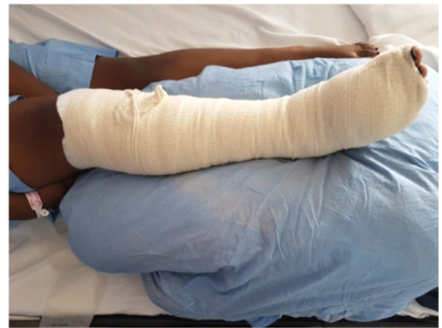
Figure 2. Elastic compression dressing applied over the limb with cellulitis.