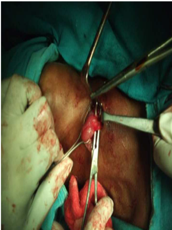
Fig. 3. shows ligation of inferior thyroid artery.