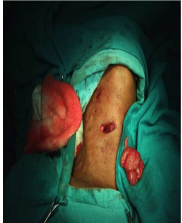
Fig. 4. shows incision after hemithyroidectomy.