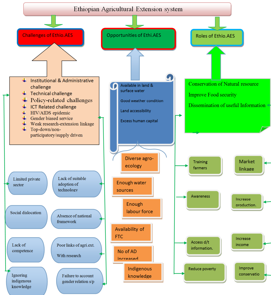
Figure 2. Theoretical framework of Agricultural Extension challenges, opportunity and roles.

allocation but also unable to use resource what they have in their hands because of knowledge, skill, financial and other problems.