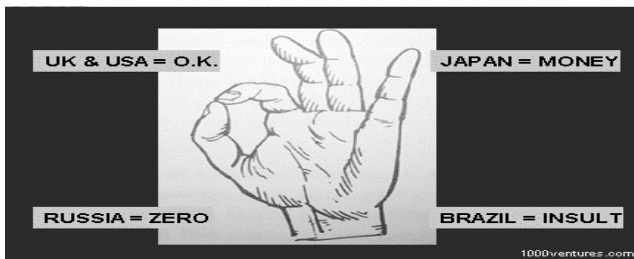
Fig 2. Cross-Cultural Communication

companies and customers, and between co-workers