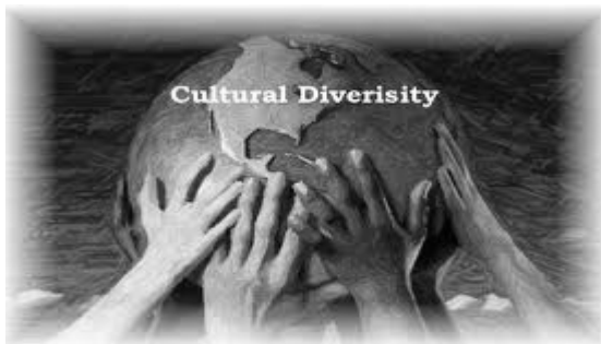
Fig 1. Cultural Diversity

Culture is a broad and comprehensive concept that includes all the ways of being. Culture is learned throughout life as one participates in family and social networks. Cultures have several components, including values and behavioural styles; language and dialects; nonverbal communications; and perspectives, worldviews, and frames of reference. Cultural practices are shared within a specific group and may or may not be shared across groups. It is important to recognize that cultures are always changing because individuals, groups, and the surrounding environment are always changing. Often members of the dominant society or subgroup of a culture view their culture as correct and all others as incorrect or even inferior.