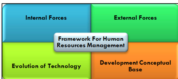
Figure 1. Framework for Human Resources Management.

A "team business unit" approach should be considered to increase efficiency, productivity, and responsiveness to the target market. This could involve organizing your staff into teams by branch, different products, regions, or types of clients. Employees prefer working in smaller business teams where they find more challenging and interesting work and where there is a better chance to see their ideas adopted. Small teams also help to foster a higher sense of accomplishment.