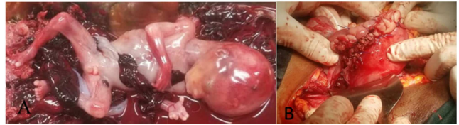
Figure 2. Jpg; A) fetus with placenta B) uterine repair after wedge-resection.

She was counselled on available fertility options.