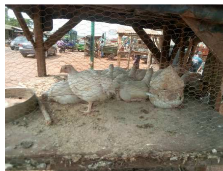
Figure 2. Sale of broiler on Lobia market (Daloa).

For the exploitation of data, statistic analysis have been done with the STATISTICA software 7.1. The descriptive statistic (elementary statistic) has permitted to determine the maximum and minimum concentrations, the average concentrations and the standard deviation of antibiotic residues concentration detected into the samples analysed. The similarity of the concentrations has been possible owing to a comparison from an average to the standard.