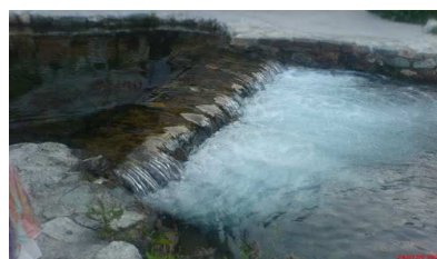
Figure 4. Appearance of whirlpool “Vrutok”

The analysis of variance at the 0.05 level of significance revealed that the population means for total As content didn't show significant difference only in the samples of potable water obtained from the water supply systems of Star Dojran and Gevgelija “Moin” ( p=0.691 ); Nov Dojran and Gevgelija “Moin” ( p=0.871 ); Star Dojran and Nov Dojran ( p=0.0695 ). This is due to the vicinity of drilled wells “Moin” to the foothills of Kozhuf Mountain, as well as, to the vicinity of the drilled wells in Dojran Municipality to the thermal- mineral area of Mala Boshka – Toplec. The analysis of variance at the 0.05 level of significance, also revealed significant difference in the populations means for the total As content in the samples of potable water obtained from the water supply system of Demir Kapija and Gradsko ( p=0.012 ). This is due to the fact that the Boshava River springs from the Kozhuf Mountain.