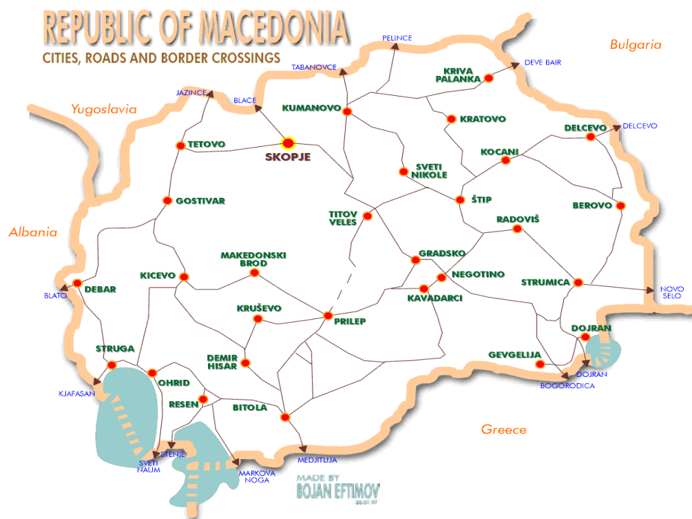
Figure 2. Map showing sampling points on the whole territory of the Republic of Macedonia