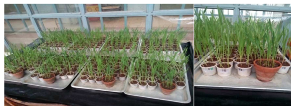
Figure 2. Selected durum wheat cultivars for seedling resistance type.

Seeds were soaked in distilled water for three days to initiate sprouting and five seeds of sprouts including susceptible check were separately planted in 5 cm diameter plastic pots (Figure 2). After sprout to start to grow; selected races 4mg spores in 1ml lightweight mineral oil suspension were inoculated. Inoculated plants were moistened with fine droplets of distilled water by using atomizer after 30 minutes of inoculation. For incubation, seedlings were placed in a dew chamber for 18 hrs dark period at 18-22°C and 98-100% RH Seedlings were allowed to dry for 2 hrs. Following this, the seedlings were transferred from dew chamber to glass compartments in the greenhouse.