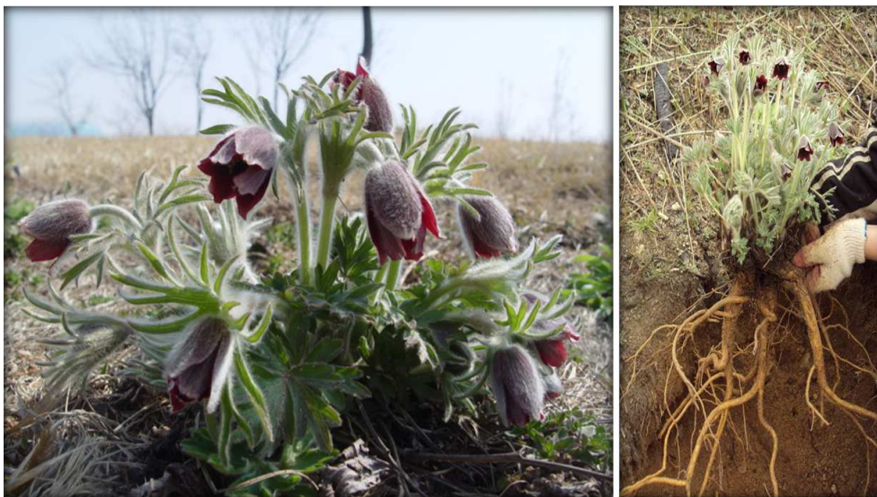
Figure 1. Images of Pulsatilla Koreana and their roots.

consecutive advanced and recurrent various cancer patients diagnosed radiologically and histologically, admitted to Sahmyook Seoul Hospital for intensified SB 365 anticancer drug treatment.