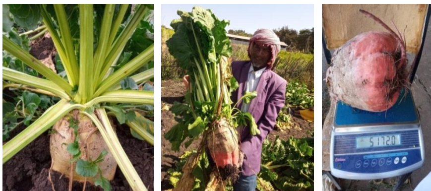
Figure 2. Image of fodder beet during field conducted.