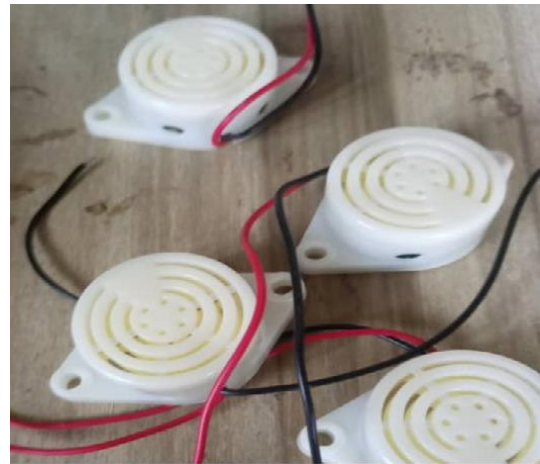
Figure 4. Buzzer.