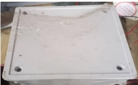
Figure 2. Project casing.