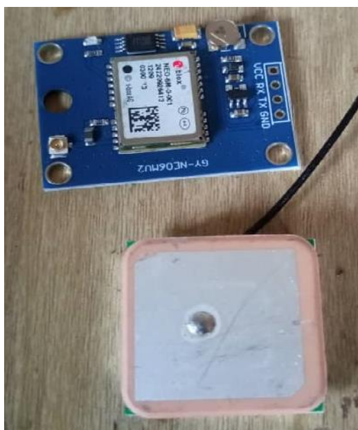
Figure 3. GPS module.