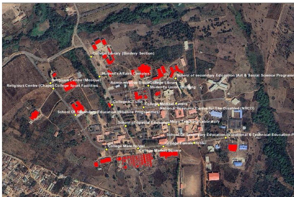
Figure 9. Satellite view of Federal College of Education (Special), Oyo, Oyo State, Nigeria.