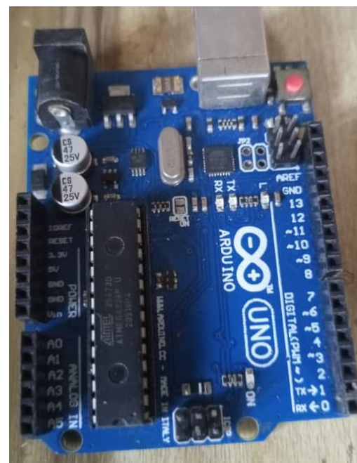
Figure 6. Arduino micro controller.