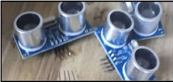
Figure 1. Ultrasonic sensor.

The devices shown below are some of the components coupled to achieve the object detection white cane.