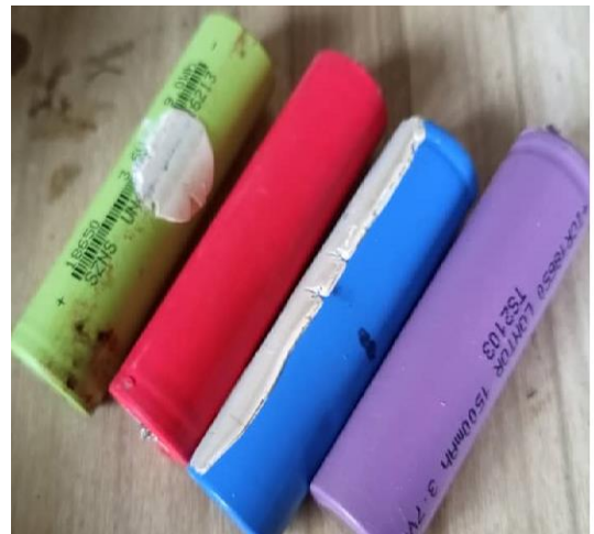
Figure 5. Lithium ion battery.