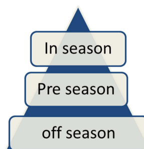
Figure 1. Showing the seasons plans.