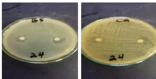
Figure 4. Antimicrobial activity of Belpharis linariifolia of seeds oil. Zone of inhibition of oil against standard bacteria and fungi.