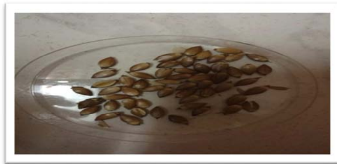
Figure 1. Belpharis linariifolia (Seeds).

Belpharis linariifolia seeds were collected from alpine north Kordfan and identified and ethnocatated by plant taxonomist at ministry of agriculture in Khartoum, Sudan. Seeds were air-dried, under the shade, pulverized and stored prior to extraction. Shade with good ventilation and then ground finely in a mill and kept in the herbarium until oil extract preparation Figure (1).