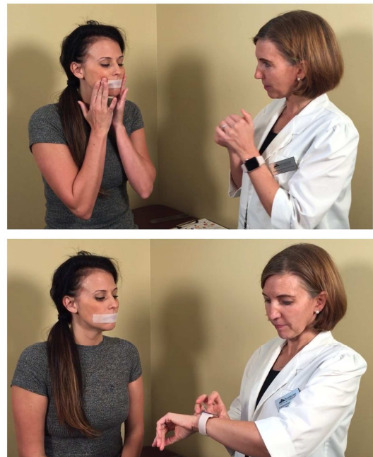
Figure 1. Lip Taping Nasal Breathing Assessment: Lips are sealed with MicroPore tape. A timer is used to assess how long the subject can comfortably breathe through the nose for up to 180 seconds with the lips taped.

Lips and mouth of the subject were sealed completely with gentle MicroPore paper tape. A timer was used to assess how long the subject could comfortably breathe through the nose for up to 180 seconds with the lips and mouth taped. Subjects were deemed to pass the test if they could successfully breathe through the nose for three minutes. This test is also known as "lip seal test" [16]. See Figure 1 (Photo of individual with lips taped as described).