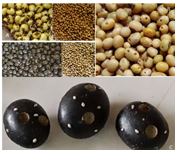
Figure 2. A) Multiple adult Callosobruchus ; B) Adult emergence holes; C) Eggs of Callosobruchus (white color).

mechanism the genotypes to C. chinensis . This could be the future research works to develop resistant/tolerant/ soybean varieties against storage pests as one component of integrated pest management option.