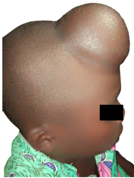
Figure 1. Overview of the patient with dermoid cyst of the anterior fontanelle.

A seven-year-old male with no significant past medical history presented to the Neurosurgery Department of Yalgado Ouedraogo Teaching Hospital with a scalp swelling over the anterior fontanelle since birth. The patient was born without complications. The swelling gradually increased in size and family decided to consult for aesthetic reasons. Physical examination showed a well-defined mass of 6 cm diameter, covered by undamaged skin located on the area of anterior fontanelle. It was soft consistency, fluctuant and negative for transillumination. The lesion was neither pulsating nor painful (figure 1).