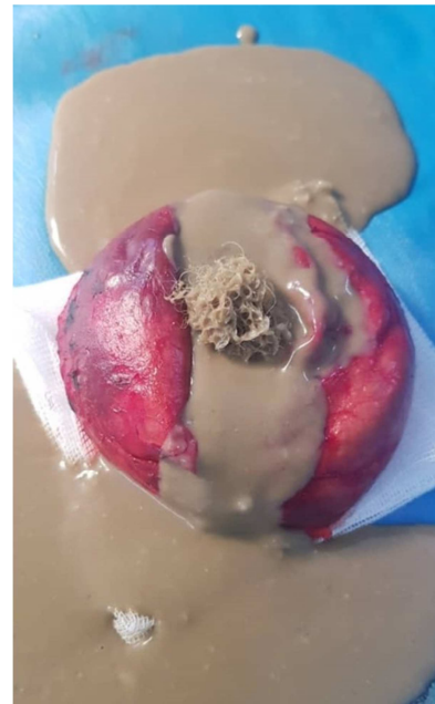
Figure 3. Detail of the lesion excision, that revealed a cyst containing pultaceous liquid with hair.

The patient underwent complete surgical excision of the scalp lesion under general anesthesia. Surgery consisted of a skin incision just above the cyst. Then, the cyst was dissected from the underlying tissue and removed completely with no complications. A skull depression underneath the lesion could be observed. Patient was discharged in stable state. The histological analysis showed the presence of keratin, hair follicles, sweat, and sebaceous glands delimited by a layer of stratified squamous epithelium (figure 3). Also, the fluid inside the cyst was yellow and pultaceous, basically composed of glucose and protein. Features were consistent with dermoid cyst. The child was doing well at follow-up. He recovered without complaints and very satisfied with the functional and aesthetical results.