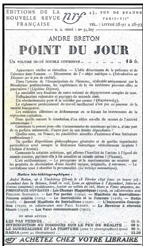
Figure 4. Point du jour .

But the second version, that of a Breton-Aquarius, born on February 18, 1896, appears in the insertion prayer of Point du jour (September 1934), "Figure 4" where it indicates the date of birth, the hour (around 8:30 p. m. ) and the detailed horoscope.