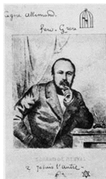
Figure 5. Gérard de Nerval.