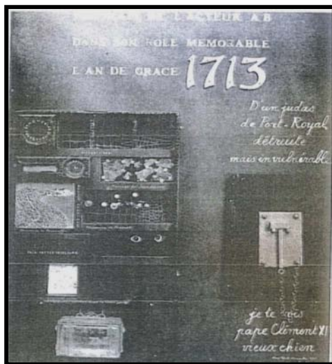
Figure 2. André Breton, Poème-objet. 1941.

“Ayant observé que, réduite aux initiales, sa propre signature simule le nombre 1713, il a été amené intuitivement à ne voir dans ce nombre qu’une date de l’histoire européenne et a eu la curiosité de relever les événements saillants que cette date peut marquer (il se pourrait en effet que l’un au moins de ces événements fût de nature à entraîner pour lui la fixation inconsciente à un temps révolu, voire l’identification avec ce temps) [19].”