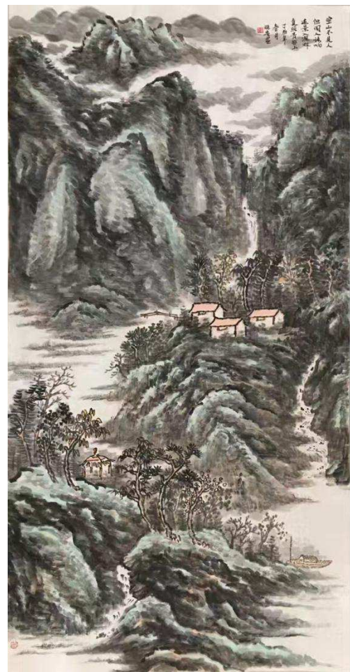
Figure 9. Landscape painting by Xiaochun Hu.

Zhenkuan Cai, a contemporary landscape painter, focus on the exploration of the form of ink and get a unique expression. Although he has rich cultural heritage, he just use today's art language to express the heavy and majestic of the yellow lands [14]. Also, he adds his calligraphy into his painting, the expression of ink is mainly by points and use different lines to make up the split the plane in the paintings, which make up the overall visual image of the picture. He totally get rid of the bound of natural landscape paintings and express in a symbolic way so that everything can be regarded as carriers for his enthusiasm [10]. In his paintings, there is nearly no blanks and lofty perspective are often used to show a vast and expanse feeling. Another painter, Youfu Jia, his paintings look beyond reality and higher than the natural beauty and spiritual shock. He use passion ink to show a powerful and broad feeling in his changeable picture.