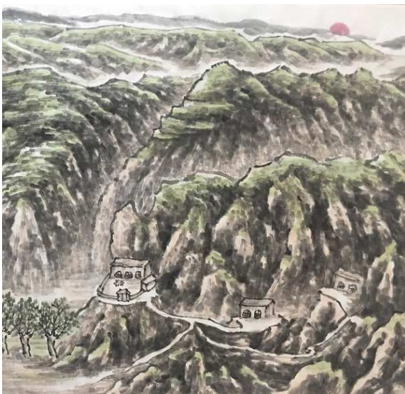
Figure 8. Freehand Landscape Painting Techniques.

The traditional chase for landscape painting is "poetry, calligraphy and painting should be all expressed", "put calligraphy into the painting" and "calligraphy and painting from the same source". When the painting and the calligraphy are in the same structure, the poetry and the painting are in the same artistic conception and assisted by the wonderful stamp, the integration of language art of the traditional landscape painting can be formed. The pen and ink is the essence in Chinese painting [9]. Today's multi-aesthetic context means freedom, tolerance and selection. The existence of multi-aesthetic context and the multi-form of art can help people open their spiritual vision, and can help the art to become more freedom, which can improve the development for today's Chinese landscape painting. Modern civilization and modern western art are great impact for traditional humanities landscape painting, the loss for the ability of calligraphy and the weakness of writing poetry make today's painter can be compared with the ancient ones. Therefore, for today's painter, they should focus on tension in the screen and to explore today's property and morphology of ink performance language.