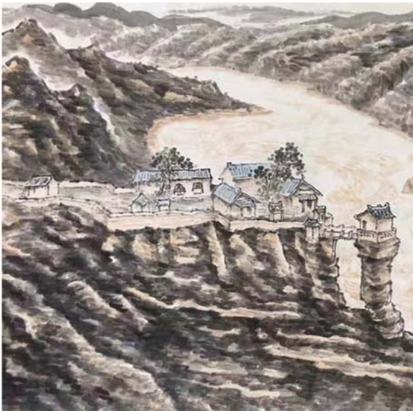
Figure 5. Freehand Landscape Painting Techniques 2.

representative, Daqian Zhang, create a new splashed-ink method. So that Guanzhong Wu learn from him and then achieve a great success in traditional paintings [6].