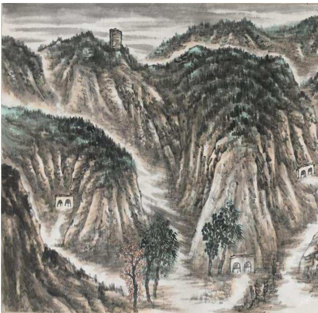
Figure 1. Freehand Landscape Painting Techniques.

Chinese traditional landscape painting is through line painting skills to express emotions of artists and do not pursue a similarity with scenery and items to use a scatter perspective method of paintings composition. The famous representative is Fu Chun Shan Ju Painting by Gongwang Huang in Yuan dynasty, whose painting skill is perfect. And through traditional landscape paintings, in order to pursue concave and convex of items, basically, Chinese traditional landscape painting does not show image shadows [3]. Nevertheless, as for western painting skills, it is significant to show natural landscape. Therefore, modern Chinese artists use traditional Chinese painting skills and additionally draw lessons from western modeling technique of expression and creation.