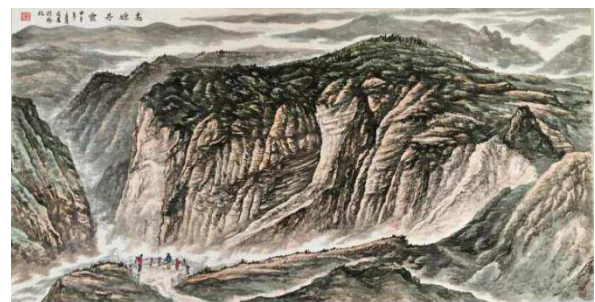
Figure 4. Freehand Landscape Painting Techniques 3.

And his paintings, such as Autumn woods, Autumn scenery, Mount Huangshan, fully demonstrate the charm of color. He often set the color from the overall effect of the picture and guarantee the priority of ink. According to his paintings, dark colors often use to serve as a foil to bright colors, such as green, yellow and orange which break the tradition of white background in the paintings. Another