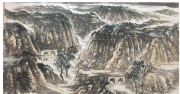
Figure 3. Freehand Landscape Painting Techniques 2.

Therefore, there are Lingnan style representatives Jianfu Gao and Qifeng Gao who apply the Japanese painting skills to traditional Chinese paintings so that they created a new painting style [4]. And another famous representative is Fengmian Lin, who devoted himself to combine spirits home and aboard through freehand brushwork paintings. His main artistic achievement is successfully introduced color art on Chinese art paper with a light feeling through his landscape paintings so that it radically changed the face of Chinese painting.