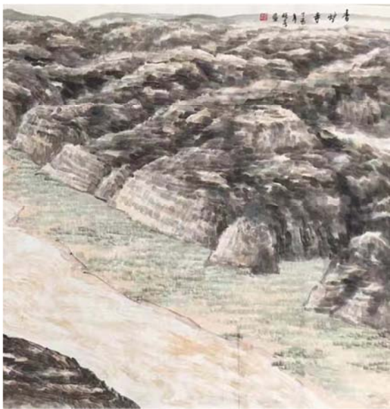
Figure 6. Freehand Landscape Painting Techniques.

If contemporary freehand brushwork in traditional Chinese paintings only depend on the western concept of color, it will lose the nationally artistic features. Therefore, it is important to combine the culture home and abroad to create the national color art performance with Chinese characteristics.