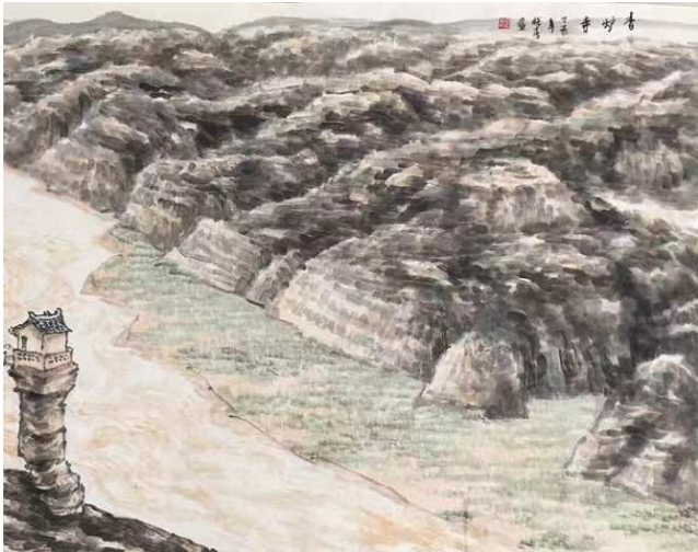
Figure 7. Freehand Landscape Painting Techniques.

In traditional Chinese landscape paintings, it is significant to observe and experience the life so that it can describe and paint the scenery by sense not depicting. It focus on express the motion of artists and subjective feeling. So in traditional Chinese painting, majority of artists created their paintings at home so that also make the Chinese paintings in symbolic expression language [7].