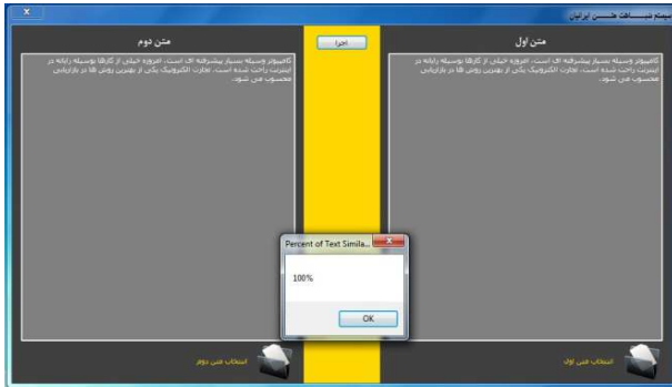
Figure 4. Two Same texts (complete similarity).