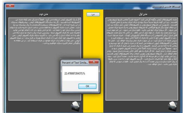
Figure 2. Two different texts with some similar words.