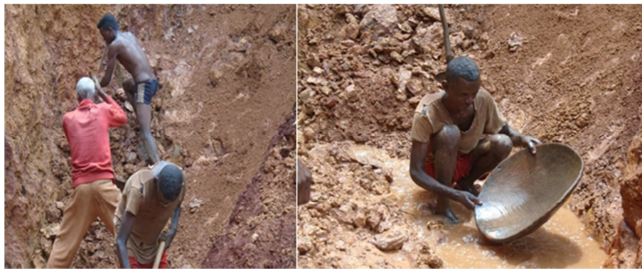
Figure 3. Artisanal mining in the study area, Source: Researcher's own photo, (2019).