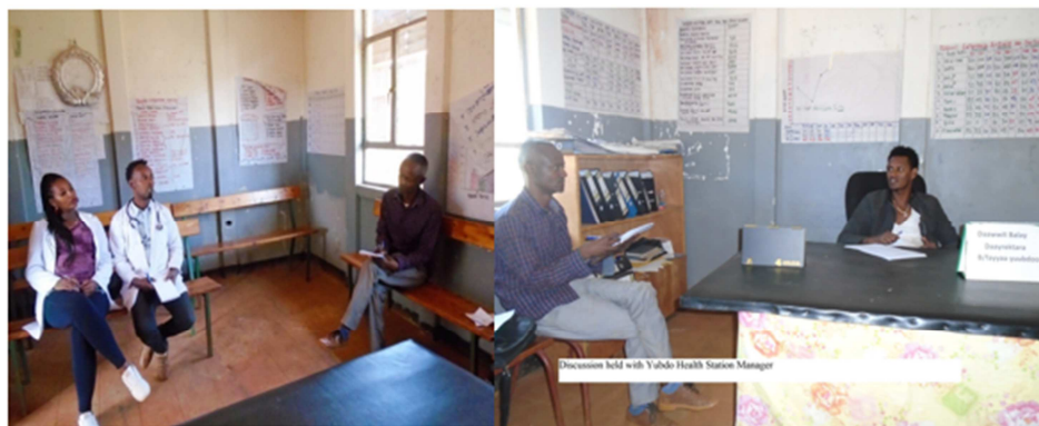
Figure 5. Interview held with Yubdo Health Station, Source: (Own photo, 2019).

All situations recorded from respondents in the sampled communities were compared with patient data obtained from Yubdo health station. The top five diseases taken from Yubdo health station OPD attendance sheet were aquatic febrile illness, neglected tropical skin diseases (onko and dermatitis), diarrhea, intestinal parasites and emphatic filiriasis. It is evident from the records of the health station that malaria, neglected tropical skin disease (onko cercis and dermatitis), diarrhea, intestinal parasites, and emphatic filarisis were the top five diseases recorded up to the present day. In line with this study, various health problems such as body pains, skin diseases, waterborne diseases, sexually transmitted diseases, cold, flu, typhoid, respiratory diseases are major diseases associated with mining activities [18, 13, 12, 2].