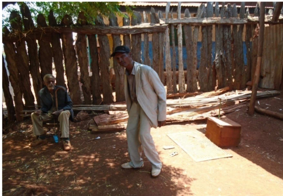
Figure 4. Man failed in open pit, Source: (Own photo, 2019).

were exposed to injuries due to poor social condition, unsuitable landscapes, poor health and occupational safety issues, absence of health insurance, absence of safety equipment, using outdated and obsolete tools and exposure to injuries [21]. Hazardous working conditions in stone quarrying (mining) and cobble chiseling works are exposed to a high incidence accidents and fatal death [41]. Rock fall, subsistence, lack of ventilation, misuse of explosive, lack of knowledge, lack of training obsolete and poorly maintained equipment are the five most frequently cited causes of accident in small-scale mining [16].