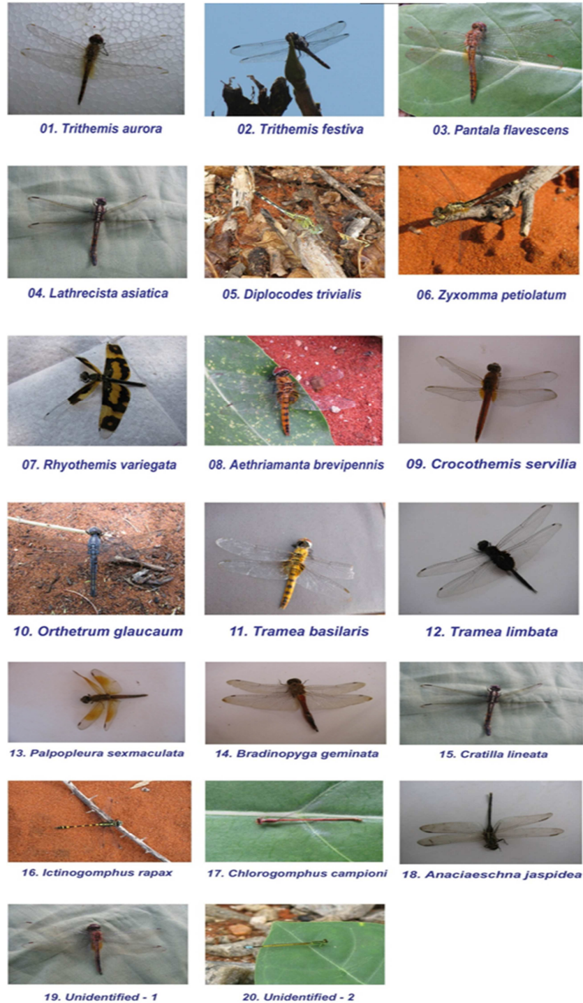
Figure 1. Showing the images of the dragonflies present in the study area during July 2009 to June 2010.

R1 - Margalef index, \lambda - Simpson's index, H' - Shannon–Wiener index.