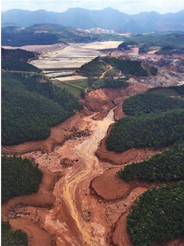
Figure 3. Fundão dam former site immediately after failure [2].