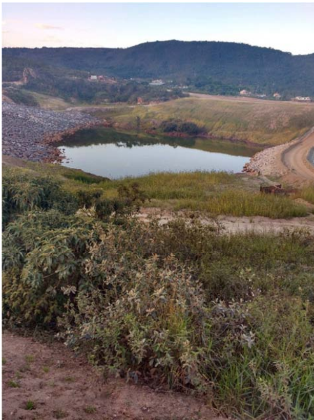
Figure 4. View of the dam formed to retain the mud - May 2017.