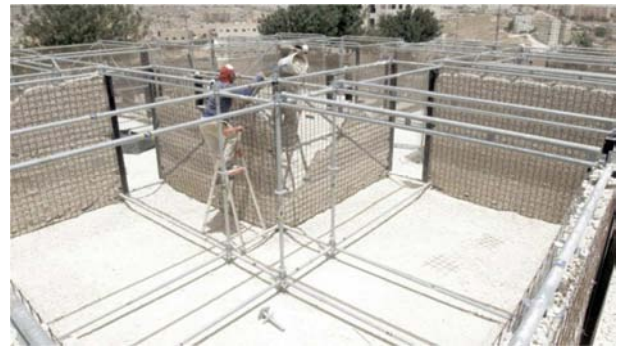
Figure 6. School for refugee children in Jordan, built with scaffolds and sand [1].