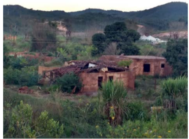
Figure 5. Bento Rodrigues in May 2017.