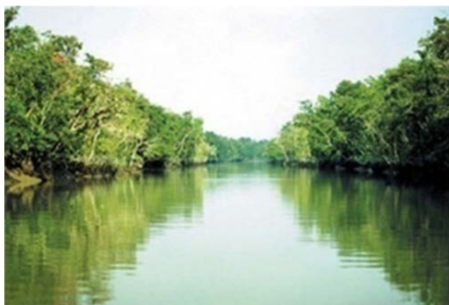
Figure 1. Water quality and mangrove forest tree before oil spillage into the Shela river of Sundarban.

Water samples were transported into the Centre for Sophisticated Instrumentation and Research Laboratory, Jessore University of Science and Technology, Jessore. University for analyzing different parameters.