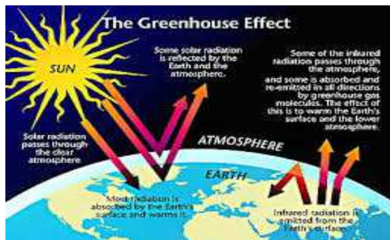
Figure 2. www.realscience.org.uk

Many gases and most importantly the water vapor and carbon dioxide contribute to the greenhouse effect that warms the earth's surface. Few scientists suspect that a portion of the warming in the first half of the 20th century was due to an increase in the output of solar energy (Hansen, et al., 1999).