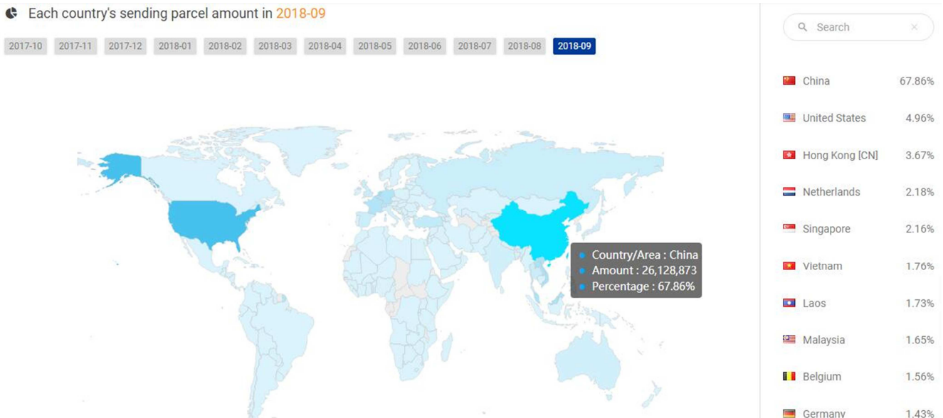
Figure 1. The proportion of parcels issued by China in the world in the past year.

may threaten any electronics retailer. The system may reduce the Cost rates and critical work of online buyers in the PRC, and are therefore not satisfied with the potential for your business to be fatal. The Chinese logistics customer pays attention to the Cost and loss risk of delivery of goods and takes note of the delivery time and actual situation of the goods. As shown in Figure 1, the number of parcels issued by China in September 2018 represents 67.86% of the world. There is a reason to believe that the establishment of overseas warehousing reduces international postage, there by reducing the cost of the company's Consumption or Consumption.