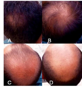
Figure 2. Patient classification based on appearance. A: Ideal outcome, B: Good outcome, C: Bad outcome, and D: Very Bad outcome.