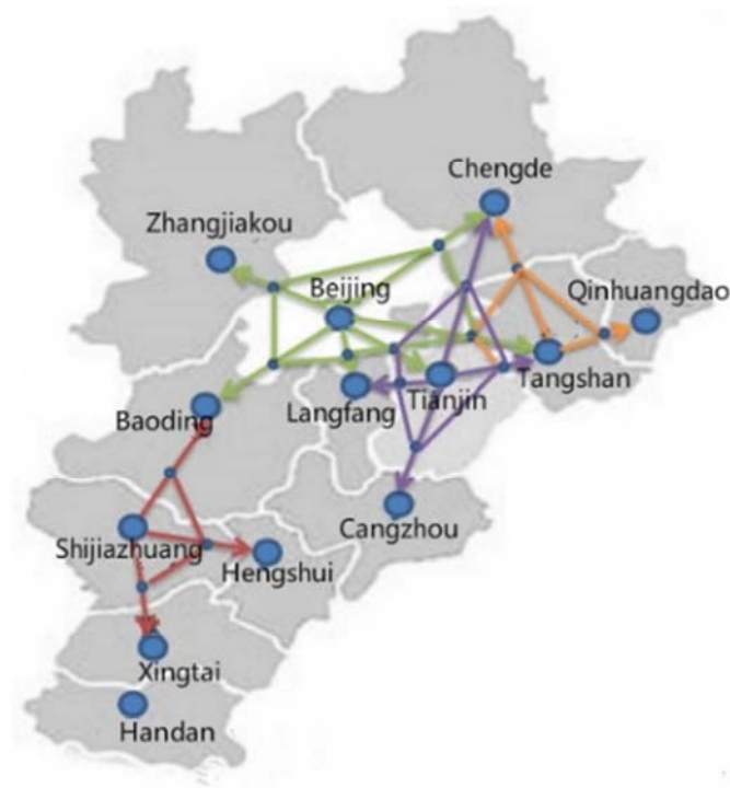
Figure 1. Break point.