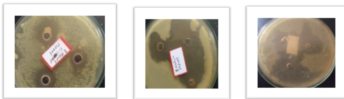
Figure 1. ZI of methanolic extract against S. aureus and against B. subtilis and that of diethyl ether extract against B. subtilis from left to right, respectively.

Phongpaichit et al [14], Dewanjee et al. [15], Peni et al. [16], Naing et al. [17] Prasannabalaji et al. [18] and many others reported the antibacterial activity of methanolic plant crude extract from other plants against B. subtilis and S. aureus . The diameters of zone inhibition of B. subtilis and S. aureus caused by methanolic crude extract of stem of Parinari curatellifolia in the work of Peni et al. [16] were 21 mm and 20 mm, respectively, which are similar to that of present work. However, the diameters of zone of inhibition of B. subtilis (8 mm) and S. aureus (9.03 mm) caused by crude extract of Diospyros peregrina as reported by Dewanjee et al. [15] are smaller as compared to that of present work. crude extract from other plants against B. subtilis and S. aureus . The diameters of zone inhibition of B. subtilis and S. aureus caused by methanolic crude extract of stem of Parinari curatellifolia in the work of Peni et al. [16] were 21 mm and 20 mm, respectively, which are similar to that of present work. However, the diameters of zone of inhibition of B. subtilis (8 mm) and S. aureus (9.03 mm) caused by crude extract of Diospyros peregrina as reported by Dewanjee et al. [15] are smaller as compared to that of present work.