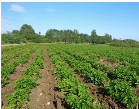
Figure 3. Mulberry fields at “Los Mangos” farm.

Studies made at the Extension Sericulture Station of Guangxi, [12, 13], with mulberry cultivars Gui Sang You 12 and Gui Sang You 62 refer to them as cultivars of big fast-growing leaves, solid stems, with a high density of branches, with intensive regenerative qualities (they can be pruned 4 or 5 times per year) and have a high recovery capability to water stress; which confers them a good behavior for sericulture and good use of sum energy because of a bigger leaf area (Figure 3).