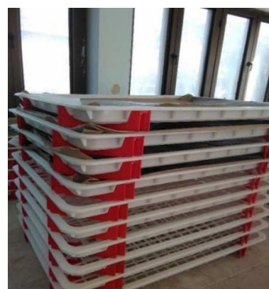
Figure 1. Tray technology where the first ages of the silkworm rearing take place.

This research was made with the silkworm race Quifeng x Bayue from China, that classified for showing good behavior under Cuba's tropical conditions [10]. The rearing cycle of 14 boxes of silkworms, with 25 thousand eggs per box. The first one rearing is made with the tray technology, from the 1st 3rd age (Figure 1) and then, they are transferred to the rearing facilities called Tunnels, (Figure 2) where the rearing cycle ends with the 4th and 5th age. These facilities have a rearing capacity of 14 boxes per tunnel.