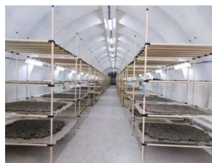
Figure 2. Facilities named Tunnels where the rearing cycle of the silkworm is completed.