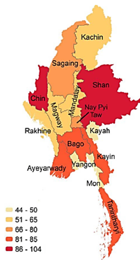
Figure 1. Under-5 mortality by states and regions.

Ayeyarwaddy region (OR: 2.62; 95% CI: 1.09-6.28; p=0.032) respectively were significantly associated with increased risk of childhood death compared with children born in Kayah region.