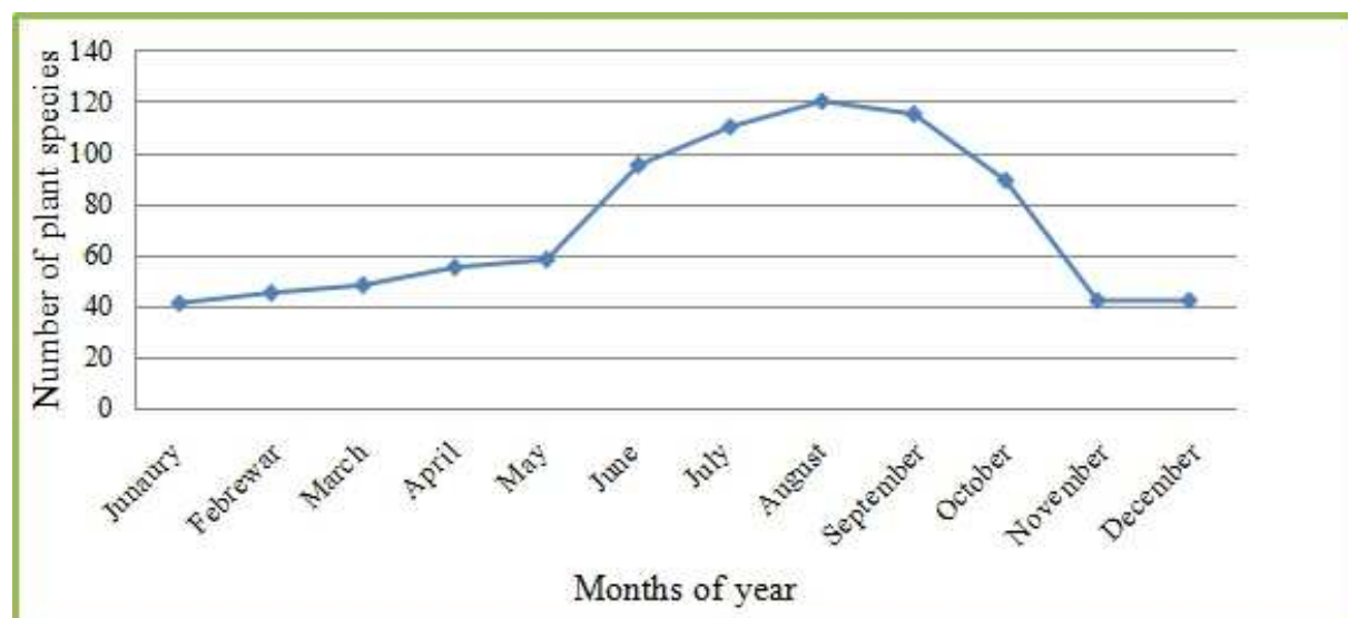
Figure 3. Plant species richness variation throughout the year.

increases significantly during this growing season of a year (Figure 3). This result is also in agreement with [41], that reported significant amounts of food-producing cultivated plants and nutrient supplying homegarden products are more available during the main rainy season between June and September at Eastern Harerge Ethiopia, around Kombolcha.