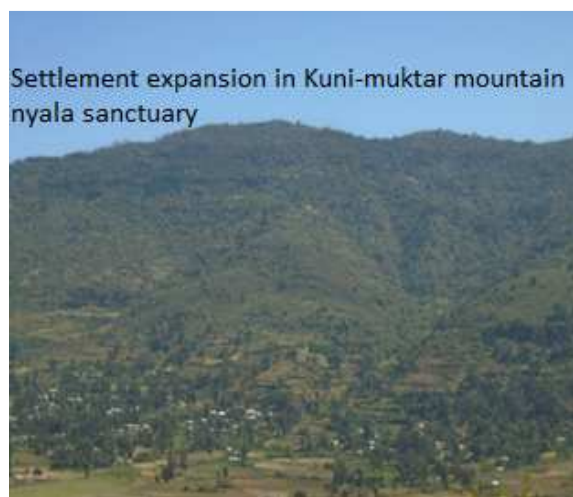
Figure 2. Photo of different wildlife threat observed in eastern Ethiopia protected area.

From the threat factors affecting protected areas, grazing by domestic was found to be the highest (0.86) threat factor index while shortage of funding for PA management and habitats as result of increased human population and expansion of invasive alien species in protected areas had a threat index of 0.83 and 0.79 respectively (Table 1). Weak law enforcements, encroachment of human settlement, human-wildlife conflict and lack of alternative livelihood activities had a threats index of 0.77 each. Fifty eight percent of the threat factors had a threat index 0.75 and below.