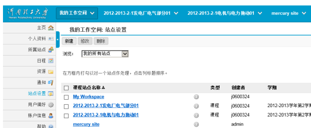
Figure 3. Site settings interface of Sakai used in Henan Polytechnic University