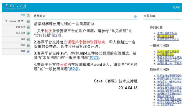
Figure 2. Main graphical interface of Sakai used in Henan Polytechnic University

Parts of graphical interface of the Sakai system used in Henan Polytechnic University are shown in Figure 2, 3, 4, 5 and 6 [14] [15] [16].