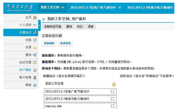
Figure 5. User preferences interface of Sakai used in Henan Polytechnic University