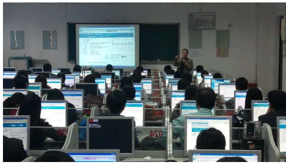
Figure 1. Training program of Sakai used in Henan Polytechnic University

conducted. Figure 1 shows one of the training programs of the University.