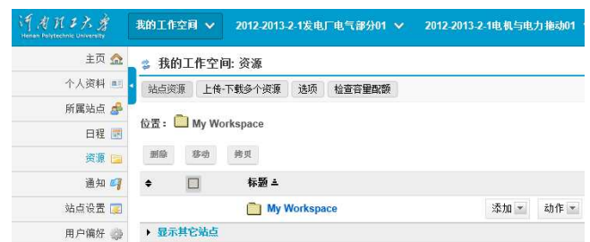
Figure 6. Resources interface of Sakai used in Henan Polytechnic University

As can be seen in Figure 2 - 6, the main modules of Sakai system used in the University include: homepage, personal information, site schedule, resources, notice, site settings, user preferences, account information, my work space and help.