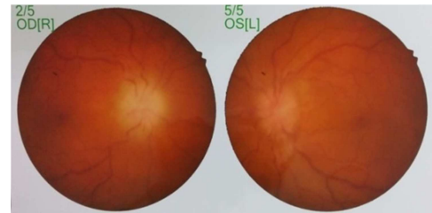
Figure 1. Color fundus photography showing bilateral papilloedema and pale optic disc on right side.

with a low normal ESR (5 mm in 1 st hour). Bone marrow study revealed pan-myeloid hyperplasia whereas trephine biopsy revealed hypercellular marrow with trilineage expansion of erythrocyte, granulocyte and hypobulbated mature megakaryocytes suggestive of myeloproliferative disorder possibly polycythemia vera. JAK-2 mutation was also detected. Chest X-ray, ultrasonogram of abdomen and echocardiography were normal.