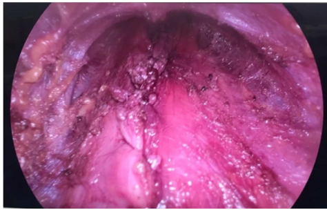
Figure 3. Strap muscles were closed.