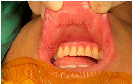
Figure 4. Oral vestibule incision after suturing.