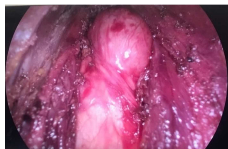
Figure 1. Rt thyroid lobe was identified.