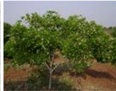
Karanj ( Pongamia pinnata )