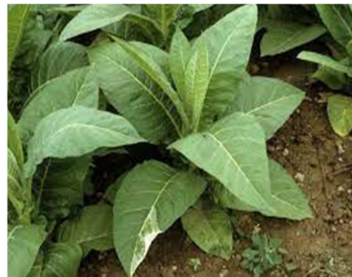
Tobacco ( Nicotiana tabacum )