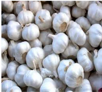
(Garlic ( Allium sativum L.))