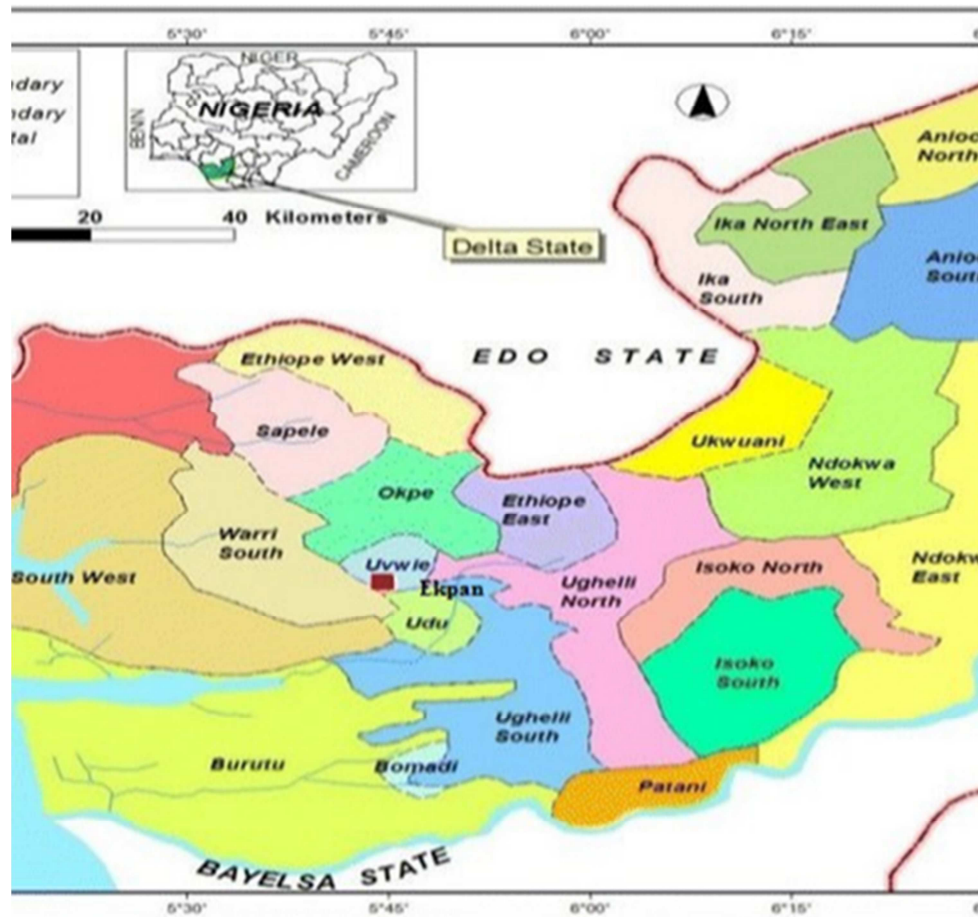
Figure A1. Map of Delta State showing Ekpan community.