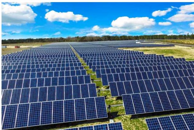
Figure 1. Example of solar energy [3].

there are certain disadvantages. Solar concentrators can alter the properties of the Earth and change its plants. The growth of the solar cells' air, the air is associated with the reflection of the Sun's light. This phenomenon can change the humidity, heat balance and direction of the wind. Low-temperature boiling fluids in solar panels can be exposed to drinking water after a long period of use.