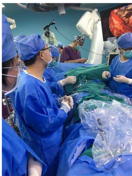
Figure 3. Cardiac surgery.

After radiofrequency ablation of atrial flutter, the surgical nurse provided the valve forming suture line to cooperate with tricuspid valve forming. The nurse is responsible for the preparation of ring detectors and artificial rings before surgery. Before opening the artificial valve ring of high-value consumables, the surgeon, instrument nurse and circuit nurse shall jointly check the model, brand and validity period. 36-37°C normal saline 1000ml-1500ml was prepared to test the tricuspid valve forming effect after completion of the forming operation (Figure 3).