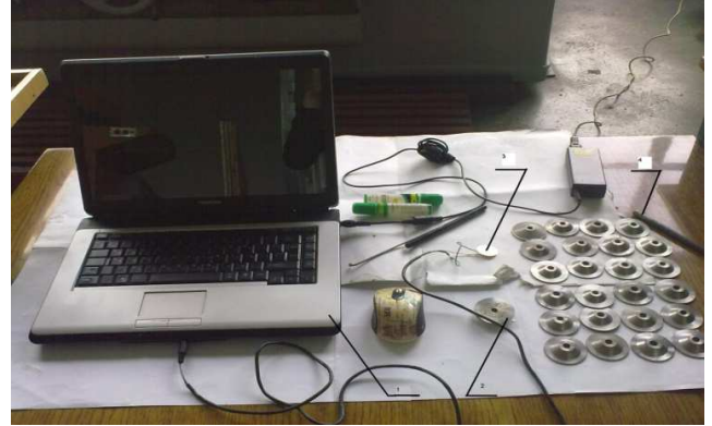
Fig. 1. The general view of the experimental setting.

conditions for maintaining the competitiveness of products is the use of resource-saving production processes, one of the promising directions is the application of non-destructive method of control based on the gain-frequency characteristic and creation of a new control system of simultaneously various detail parameters (quantitative and qualitative).