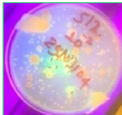
Figure 2. Primarily screening of Pseudomonas fluorescens based on pigment production under UV light

from rhizospheric soil of healthy faba bean on King's B medium and observed under UV light at 365 nm for 30 seconds as indicated figure 2.