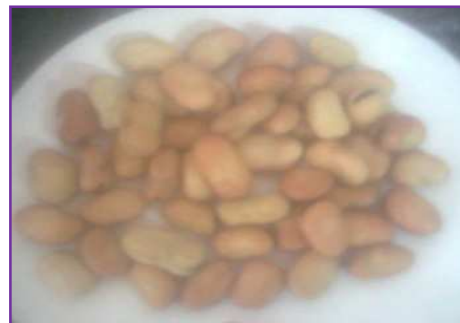
Figure 1. Faba bean sample.

present work were obtained from Holeta Agriculture Research Centre, Ethiopia. The three varieties of faba bean seed (namely: NC 58 susceptible variety, Moti moderate variety and ILB 938 restively resistant variety) was obtained from Holeta Agriculture Research Center (figure 1).