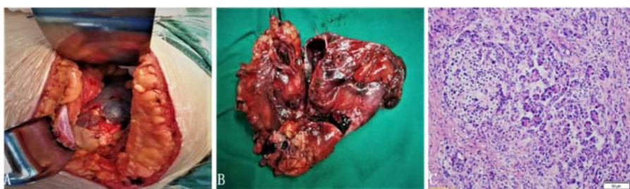
Figure 2. A-B Tumor tissue C Immunohistochemistry.