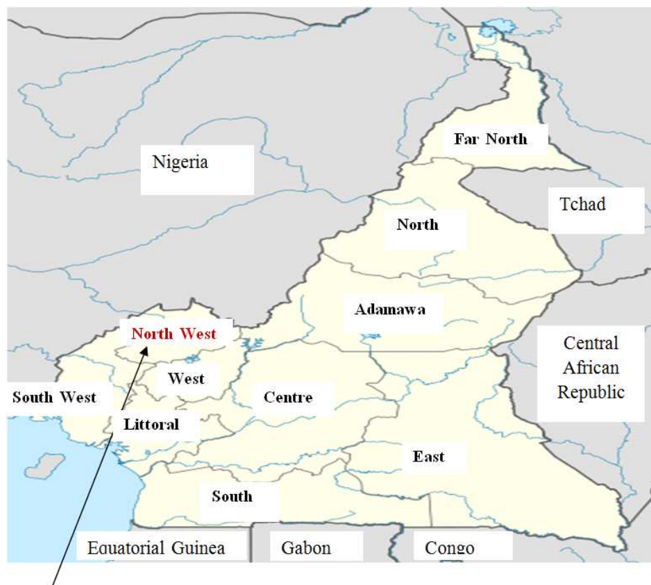
Figure 1. Map of Cameroon showing location of Bamenda and other regions in Cameroon.

This study was carried out between September 2014 and February 2015 in the Bamenda Central Prison found in Bamenda I in the Mezam Division, North West Region of Cameroon. The climate of Bamenda is typically tropical with two seasons, the dry season and the rainy season. The rainy season begins from about mid March to sometimes in mid October. The dry season begins from mid October to about mid March. The temperature in the dry season sometimes go as high as 38°C during the day and as low as 15°C at night. In the rainy season, the temperature is generally milder with an average daily temperature of about 25°C. The climate is gradually reducing conferring a high rainfall and a conducive environment for accusation/transmission of most gastrointestinal parasites [10].