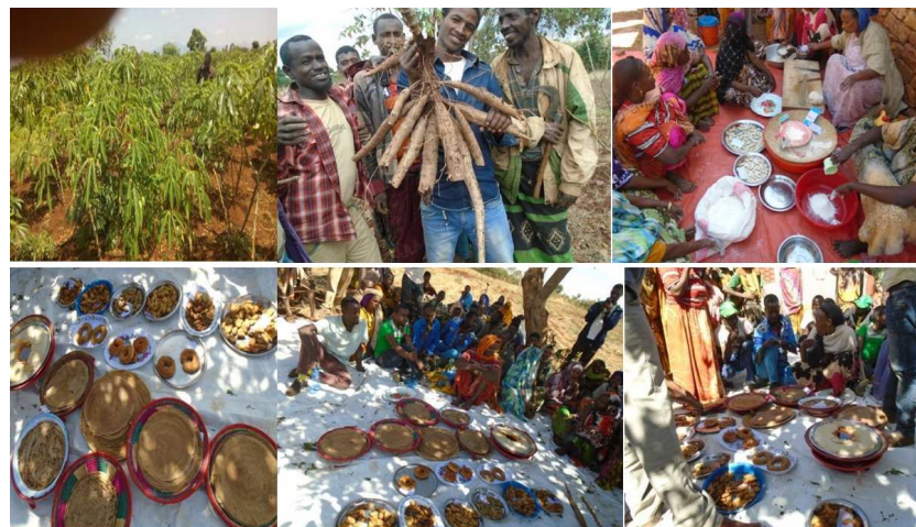
Figure 3. Pictorial supporting data taken during cassava processes and farmers' food tasting.

Among the mixing percent, 50% cassava and 50% wheat flour were the most preferred and selected by farmers. Based on the color preference kule, kelo and standard check varieties were selected and accepted by farmers respectively. The farmers were interested in the production of cassava in the future for their consumption, marketing and promised to allocate their land for cassava planting in percent correlate to other crops they have been producing for long time.