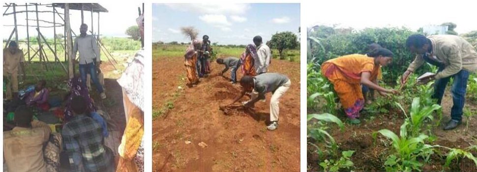
Figure 1. Pictorial supporting data taken during training (theory plus practice) given.

At demonstration stage, training is the most important thing in the extension approach. As a result training is an impart knowledge and develop skill of farmers to adapt new practices. In order to utilize the technology successfully, farmers, DAs and experts need training. Intensive knowledge and skill based training from launching the activity up to food utilization were given for target groups. A total of 38 target groups were participated during processing of training. Among them, 30 farmers, 6 DAs and 2 experts were involved. From the total of the participants 14 females were involved to keep the gender balance. The training was given by multidisciplinary team on cassava production and management (utilization and input application method, weeds, disease and insect controlling mechanism), information exchange. Thirty eight manuals prepared and delivered for the participants.